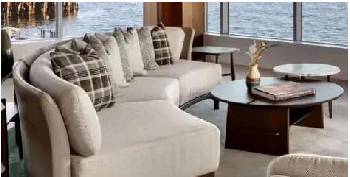
Muir, A Luxury Collection Hotel, Halifax & Fogo Island Inn

This itinerary is perfect for: travelers drawn to maritime history, design-forward stays, and raw coastal landscapes.