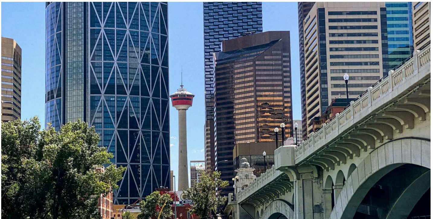
Calgary & Baker Creek by Basecamp

This itinerary is perfect for: travelers who want a polished city break paired with a cabin-in-the-woods Rockies retreat.