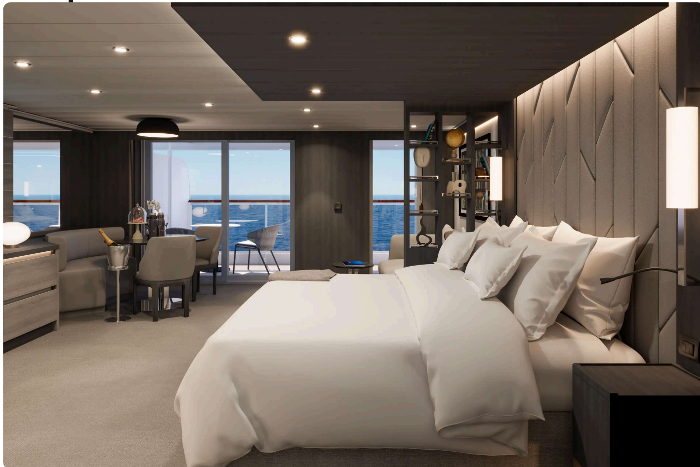
Explora III.