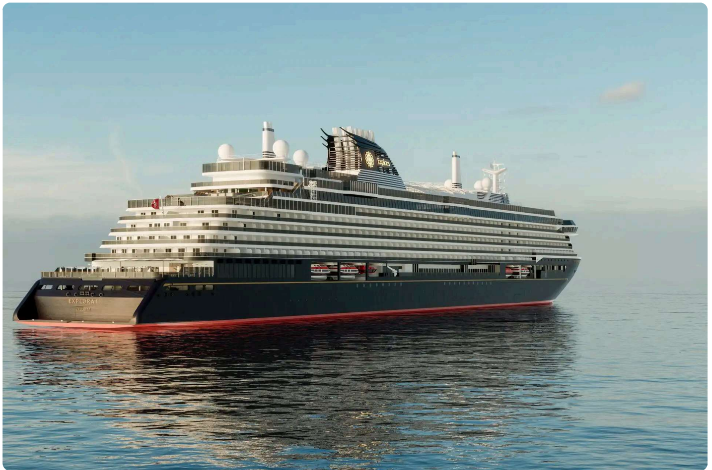
Explora III.

2026 is shaping up to be a big year at sea. Between new small-ship yachts, Asia's expanding cruise scene, and a wave of fresh transatlantic and expedition routes, there's plenty to watch.